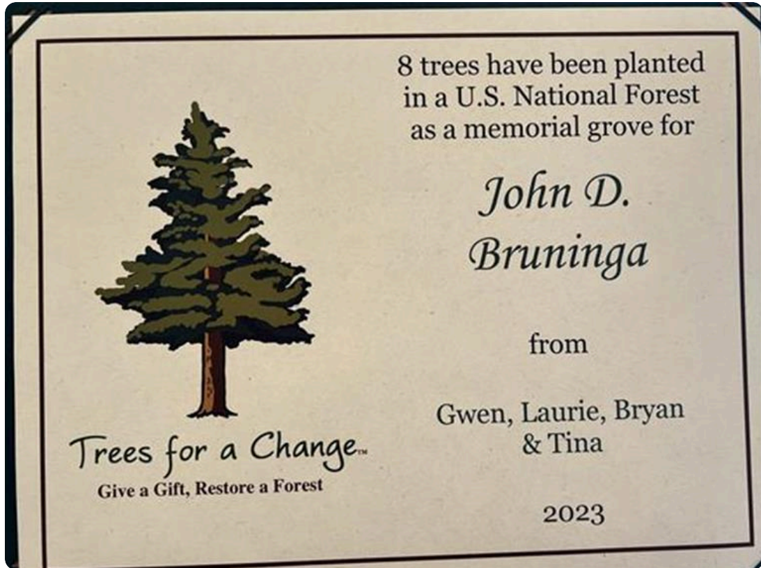
Trees for a Change